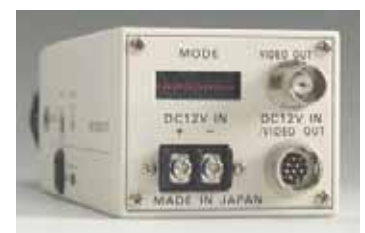
Rear control panel