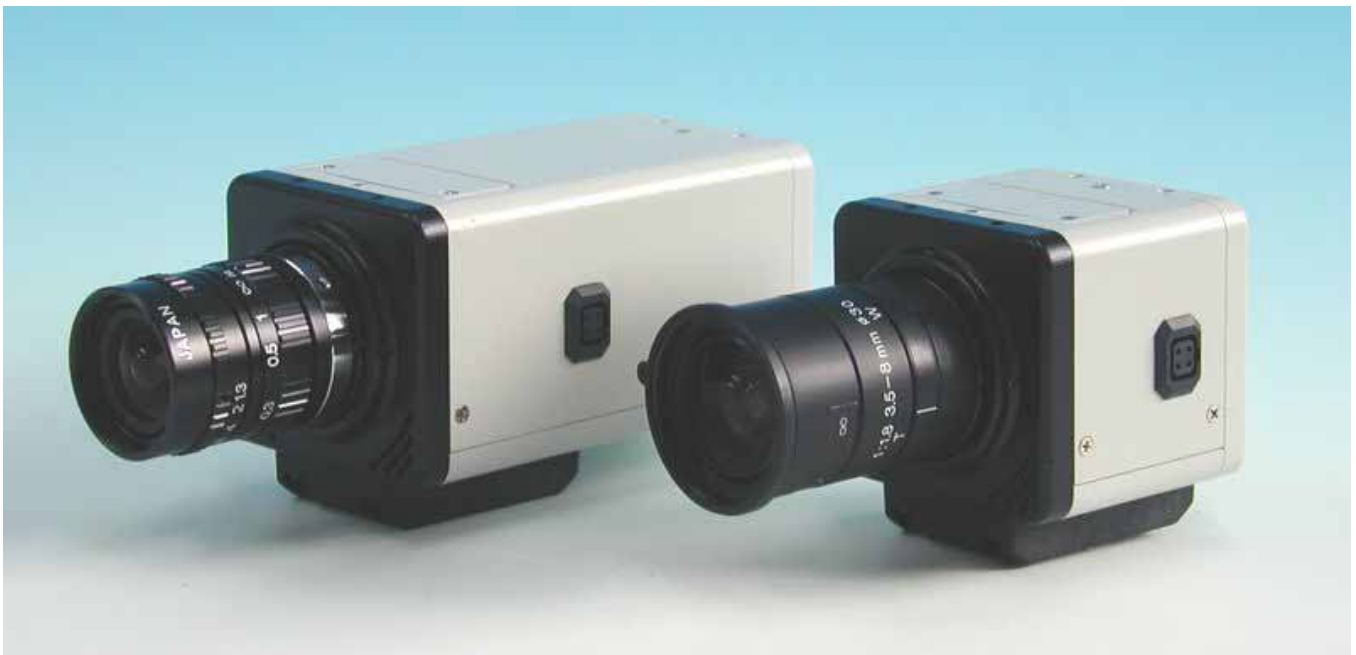
CT-221L / 225L